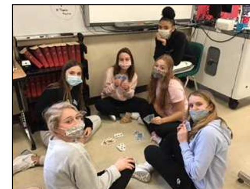
Schools Week will be shared.)