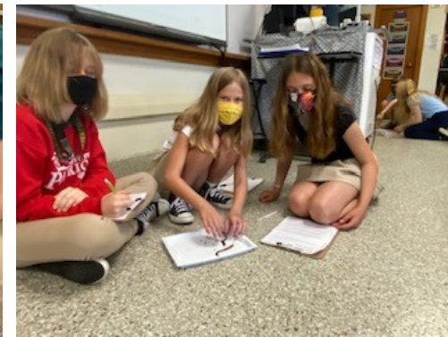
Students in 5th grade had an opportunity to learn about decomposers in their science lesson. They observed, measured and identified the parts of an earthworm.